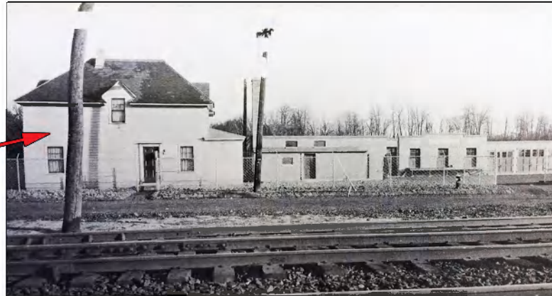
Public Works Service Building/ Caretaker's Cottage Erected 1931 at a cost of $23,565 1931 Longmeadow Annual Town Report