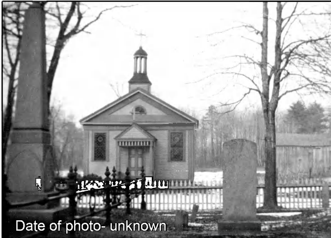
Date of photo- unknown