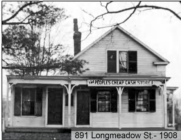
891 Longmeadow St.- 1908