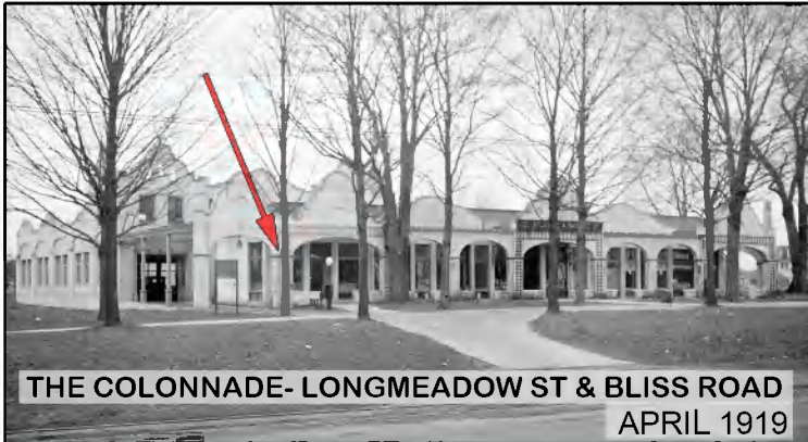
THE COLONNADE- LONGMEADOW ST & BLISS ROAD APRIL 1919