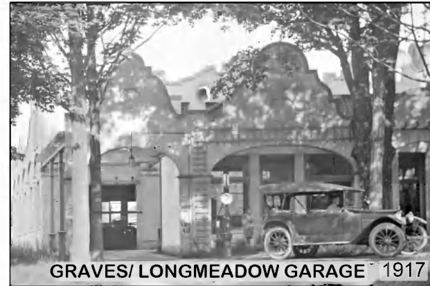
GRAVES/ LONGMEADOW GARAGE 1917