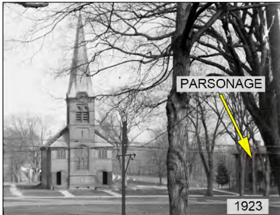
In this 1923 photo the Chapel has disappeared and the Old Parsonage has been moved to its current location at 777 Longmeadow Street.